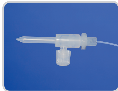
Savillex PFA C-Flow Nebulizer

The design of the C-Flow features a unique two-piece construction, which allows for very precise assembly and optimization of argon back pressure. This is key because back pressure directly impacts droplet size and signal sensitivity. The design also gives better reproducibility in performance than any other microconcentric nebulizer. This is especially important for the lowest uptake rate nebulizers, which are the most challenging to manufacture. As a result, C-Flow target uptake rate ranges are narrower than any other microconcentric nebulizers. The two-piece C-Flow design also offers additional benefits: because the capillary is supported all the way to the tip, all C-Flows can be backflushed safely without risk of damaging the capillary, and lifetime is significantly increased compared to other PFA nebulizers. All C-Flow microconcentric nebulizers feature a uniform capillary ID all the way from the sample to the tip, giving better than expected tolerance to particulates and high TDS (total dissolved solids). Finally, C-Flows are manufactured in both conventional and desolvator versions, which allows for optimum performance at the widely different operating temperatures of both applications.